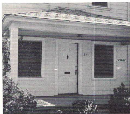
The new German, Art and French Departments, 243 Vernon.

WANTED: Several socks that were submitted to Women's Club for darning. Please return to Don Waterhouse.